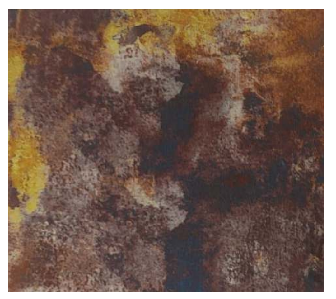
HALDEN | 910