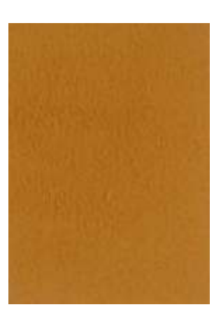
VELVETO | 919