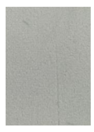
HALDEN | 912