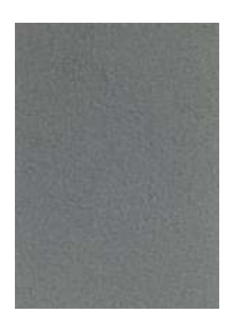
VELVETO | 944