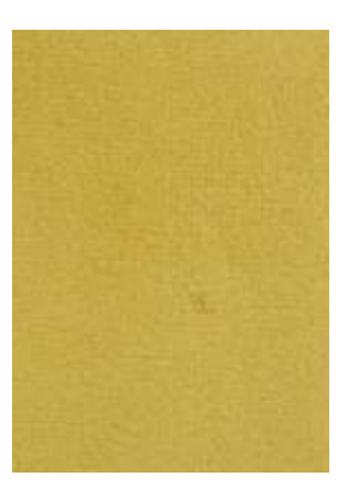
VELVETO | 917