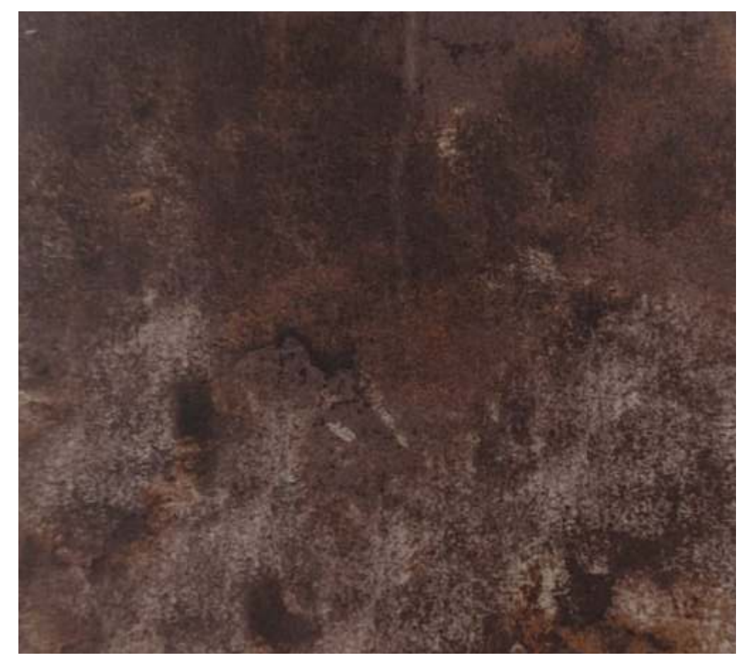
HALDEN | 908