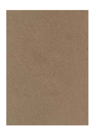
VELVETO | 936