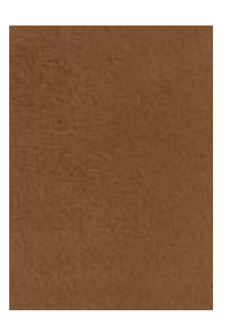
VELVETO | 931