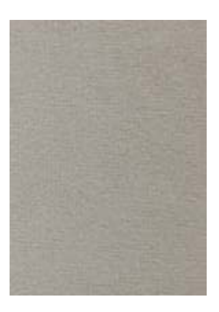
VELVETO | 908