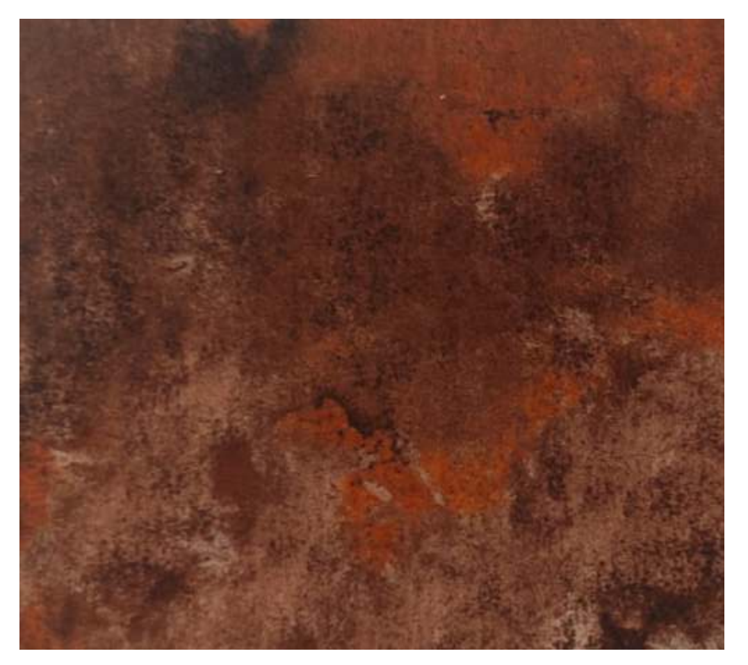
HALDEN | 907